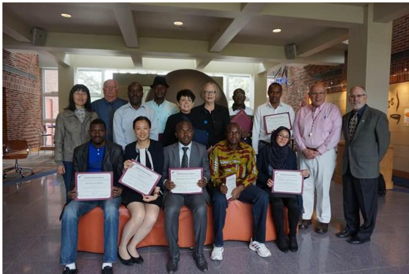
2015 Hubert H. Humphrey Fellowship

The Department of Educational Leadership had the fortunate opportunity to work the 2015 Hubert H. Humphrey Fellows. This program “brings young and mid-career professionals from designated countries to the United States for a year of non-degree graduate-level study, leadership development, and professional collaboration with U.S. counterparts”. The University of Montana’s English Language Institute assists the fellows with their transition to the United States and the English language. The EDLD faculty hosted many sessions over the past few weeks teaching the fellows about leadership, trust and group dynamics, power and authority, and leadership reflection. Our faculty would like to congratulate the fellows on the completion of their leadership course work and hope to stay in touch with the 2015 Humphrey Fellows.